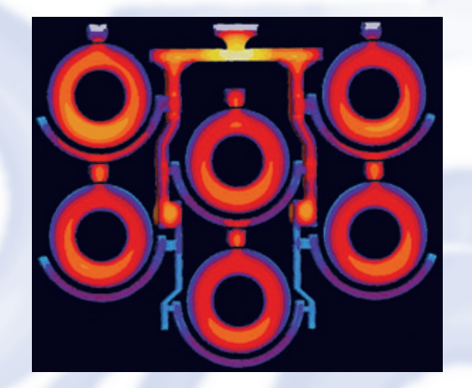
Solidification of a break disc pattern

24 Spring 2007 • Vol. 5 No. 1 • inSiDE Spring 2007 • Vol. 5 No. 1 • inSiDE