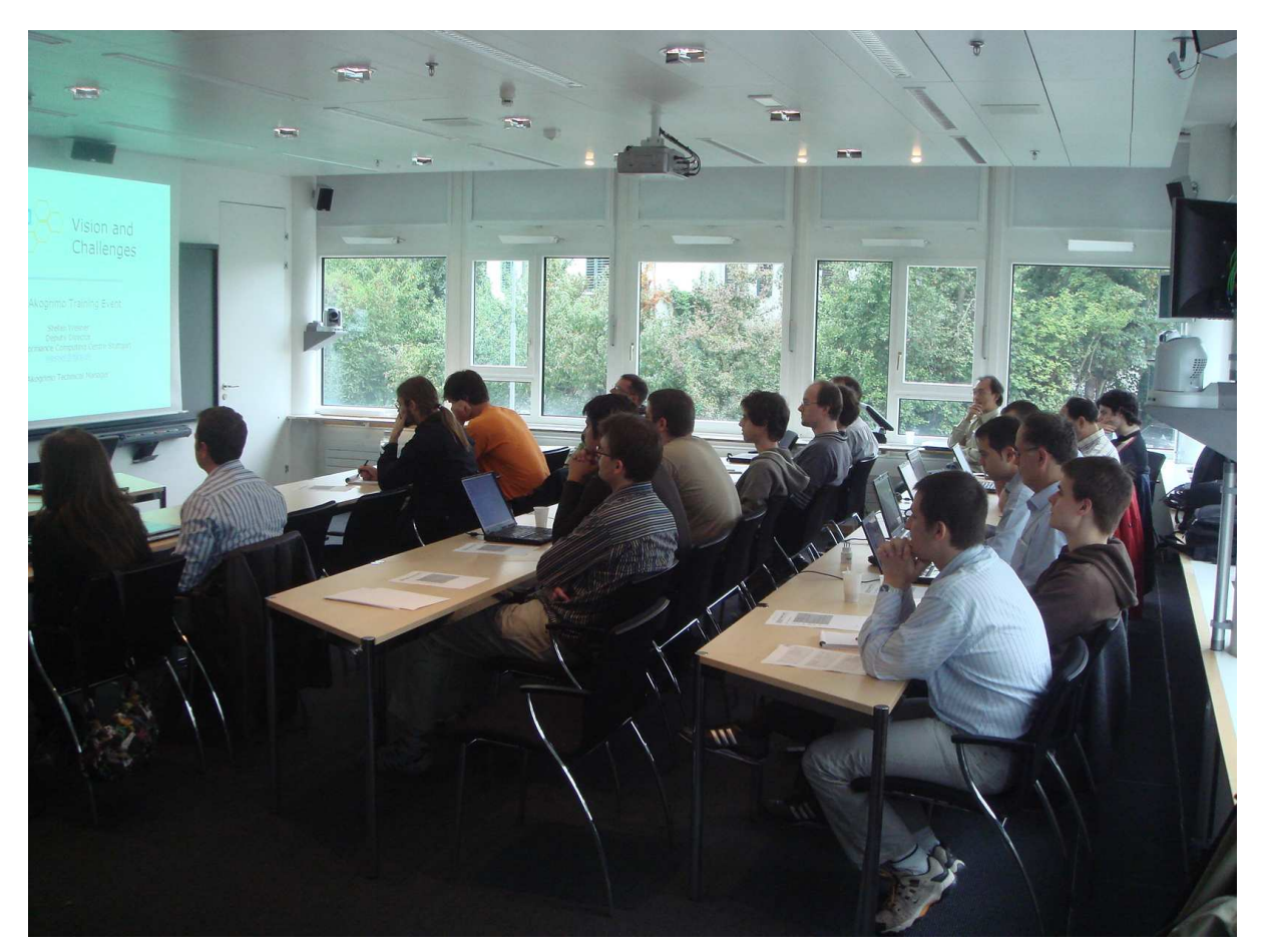
Figure 3: Akogrimo Seminar attendance