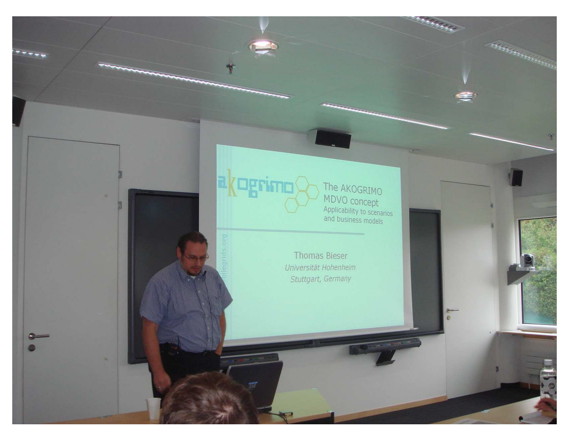
Figure 2: Lecture in Akogrimo Seminar

The training seminar was announced in the Zurich local environment, to universities and potential interested business in the area, as well as in several distribution lists and also through the IST Grid collaboration, on training mailing lists to other Grid projects.